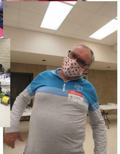
Red Cross Blood Drive