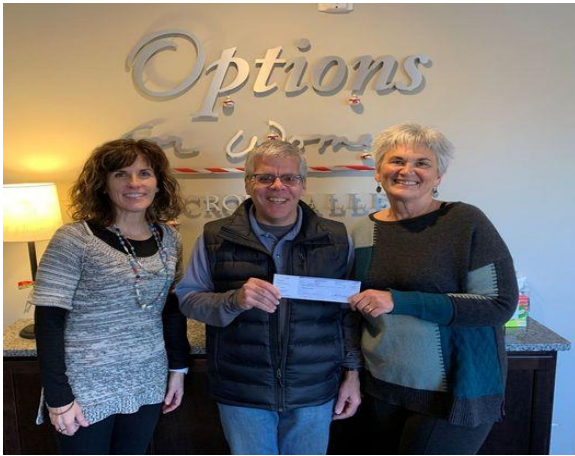
Charitable donations to Options for Women and Rhinestone Raiders Adaptive Cheer Team